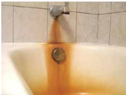
No Iron Stains