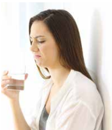
No Sulfur Odors