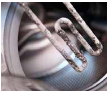
HARD WATER SCALE

Hard water scale forms in your pipes and water related appliances. This scale may damage your water heater, washing machine, dish washer, coffee maker and other appliances.